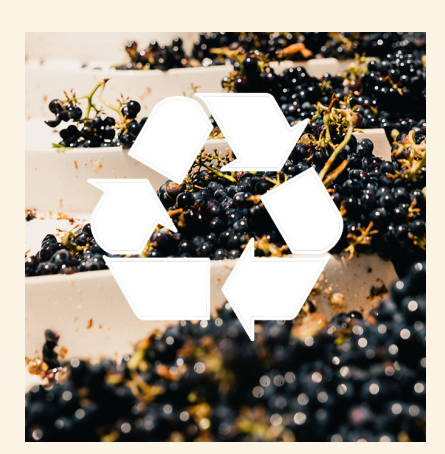
100% Recycled Water and Green Waste