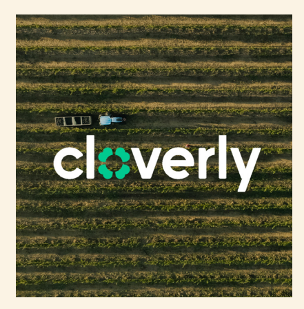
Offset 100% of Carbon Emissions from DTC Wine Shipments